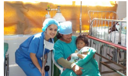
One of many patients with a team member

the hotel to the Hospital Enrique Aguilar Cerrato (HEAC) and began setting up the equipment while we screened the patients scheduled to undergo surgery on Monday. Upon unpacking we realized that we had left behind the light source for the camera. Fortunately, we were able to replace it with one available at HEAC. Since we only had one tray of laparoscopic instruments, we had to interpose a smaller case in between cholecystectomies so we could sterilize the set of instruments.