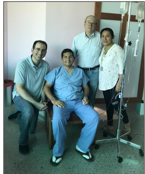
Right: on the second Postoperative day