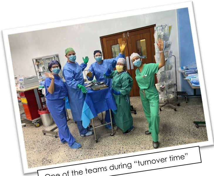
One of the teams during "turnover time"