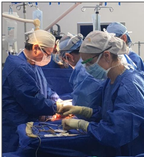
Left: The initial surgery on June 28 th , 2018