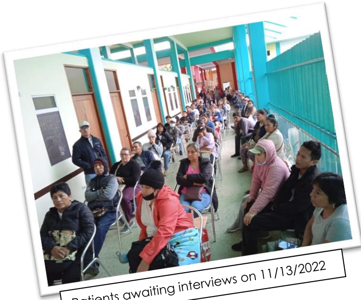
Patients awaiting interviews on 11/13/2022