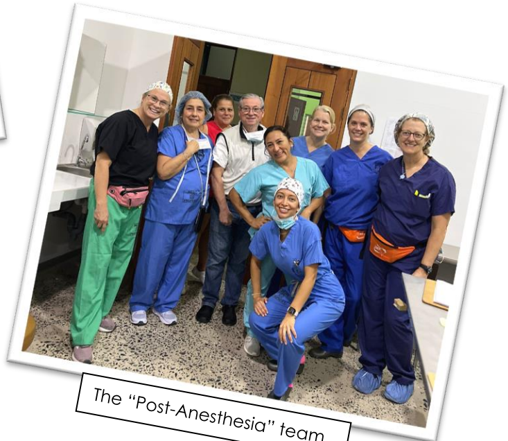
The "Post-Anesthesia" team